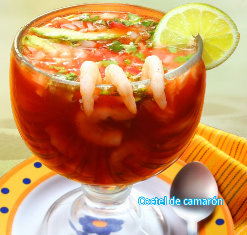
Coctel de camarón

Shrimp in a cocktail sauce, lime juice, tomatoes, cilantro, onions and avocado.