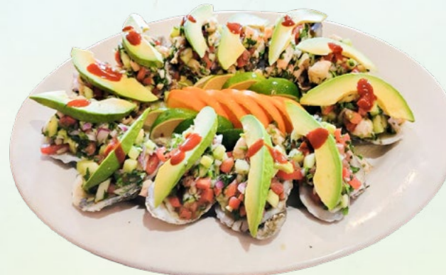
Ostiones en su concha