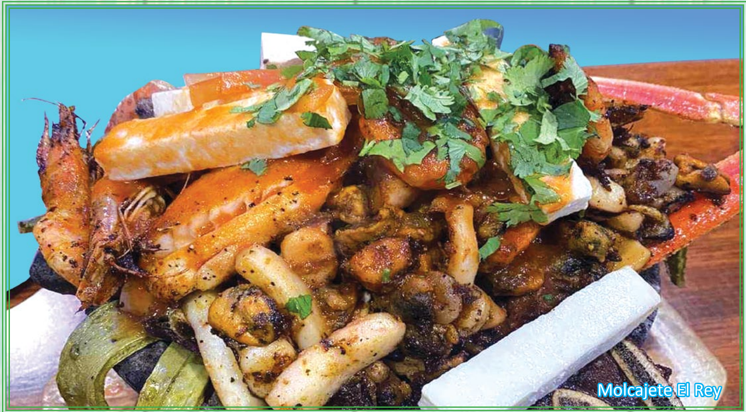
Molcajete El Rey