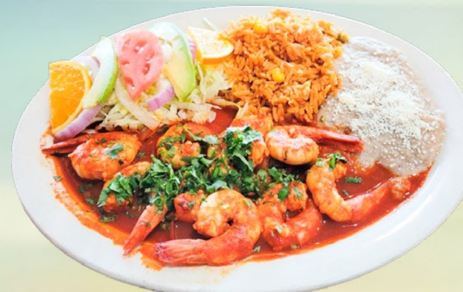
Camarones a la diablo