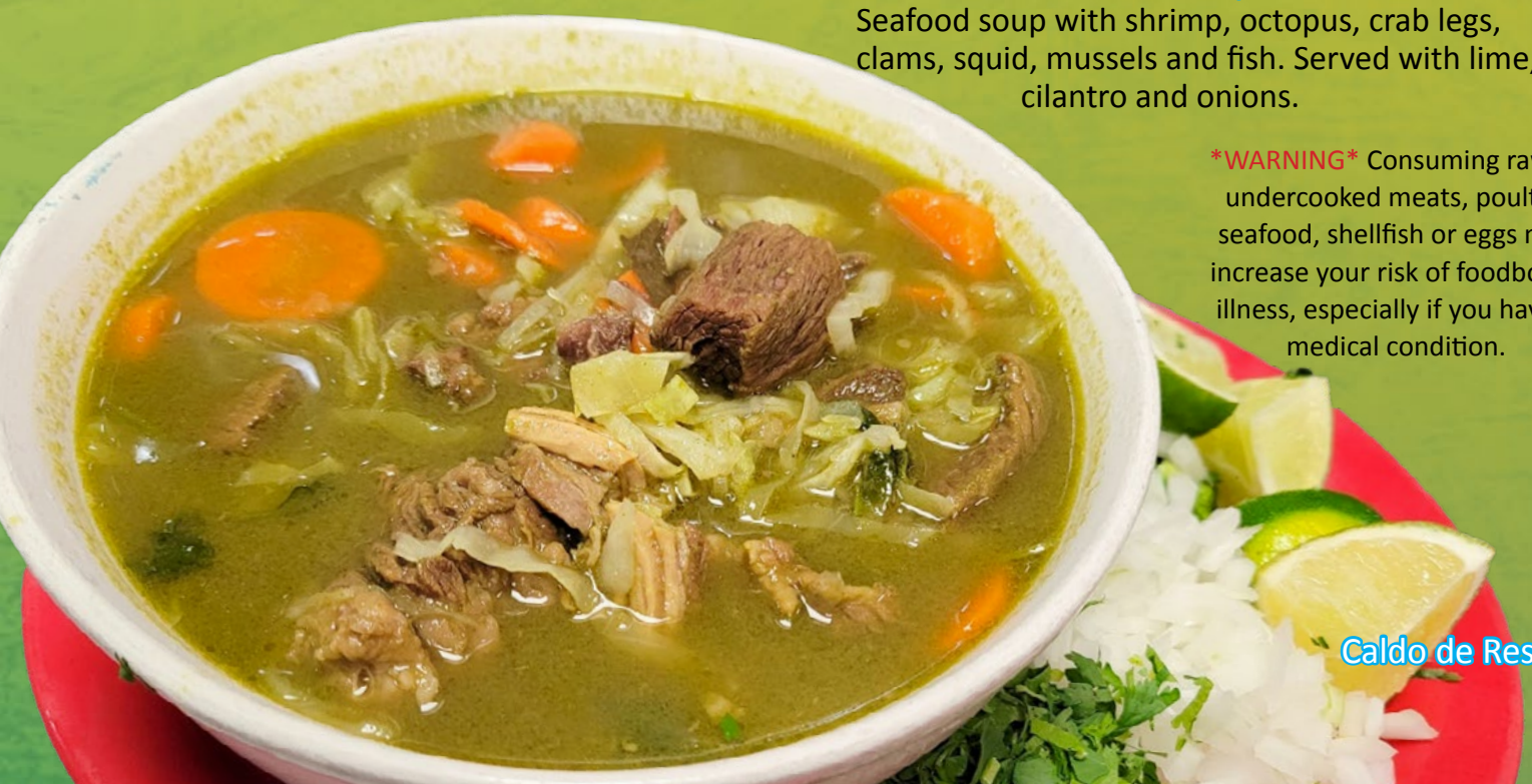
Caldo de Res

*WARNING* Consuming raw or undercooked meats, poultry, seafood, shellfish or eggs may increase your risk of foodborne illness, especially if you have a medical condition.